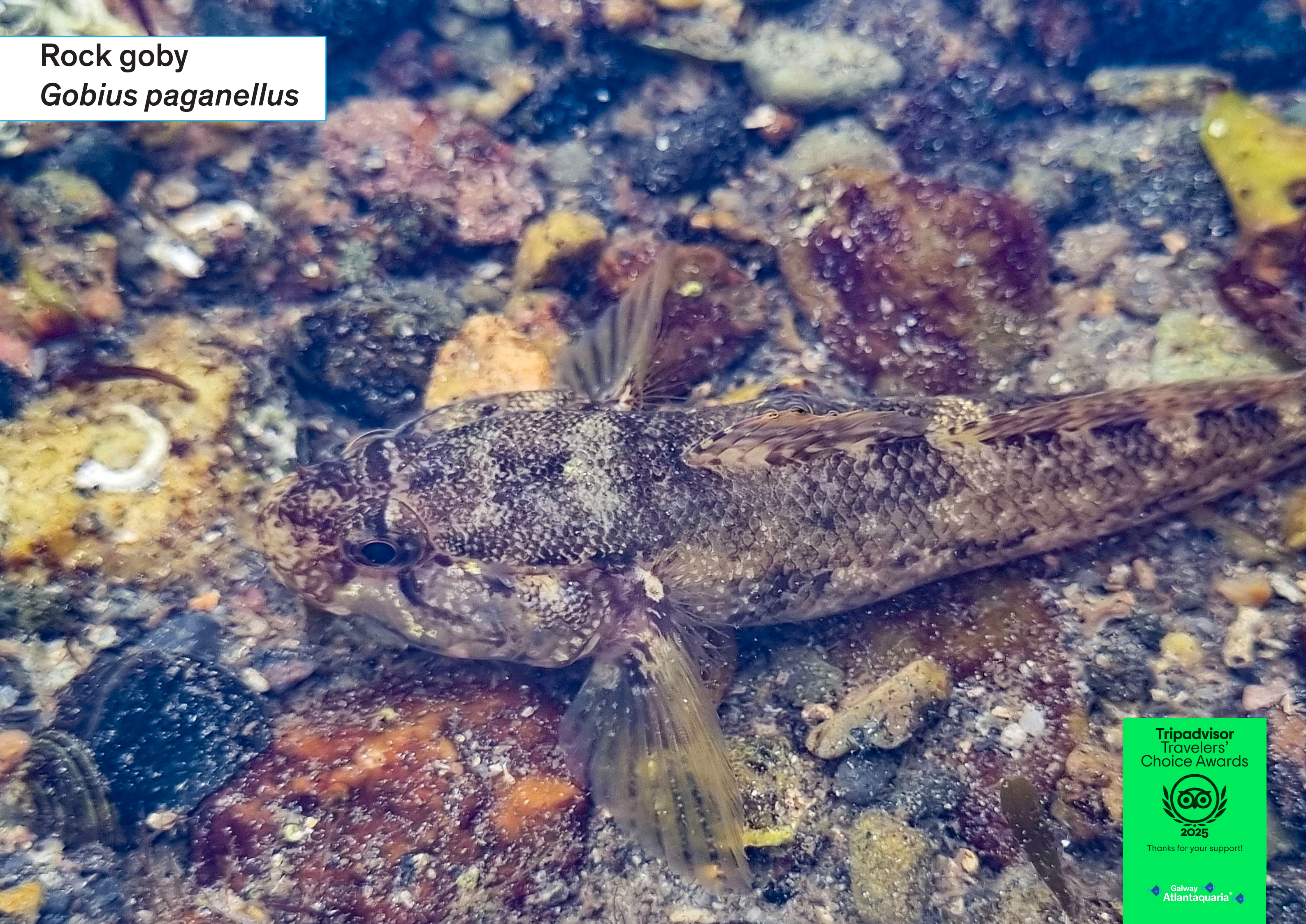
Rock goby Gobius paganellus