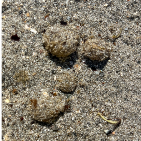
Eulalia viridis - Green leaf worm (eggcase)