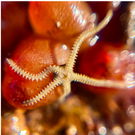
Ophiura ophiura - Brittlestar