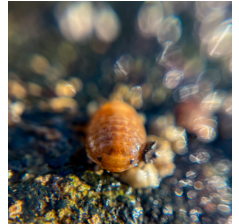
Jaera albifrons or Sphaeroma serratum - Pillbug