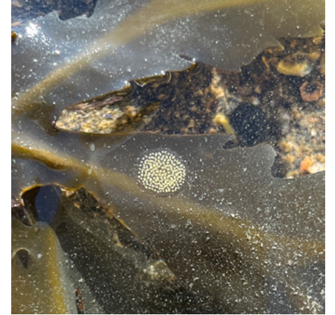
Littorina littorea - Periwinkle egg cases