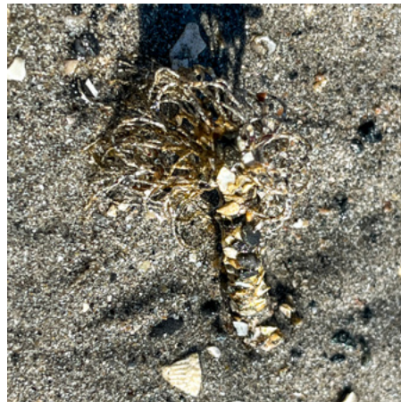
Lanice conchilega - Sand Mason Worm

We have more video of the Rockpools, and Species on our YouTube Channel, see: /GalwayAquarium