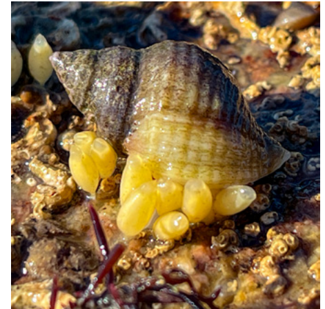
Nucella lapillus - Dogwhelk (with eggs)