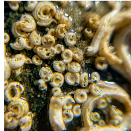
Spirorbis (Spirorbis) spirorbis - Sinistral spiral tubeworm