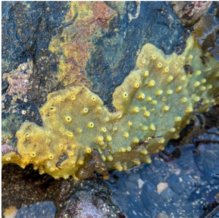
Halichondria panicea - Breadcrumb Sponge