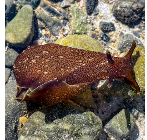
Aplysia punctata - Sea Hare