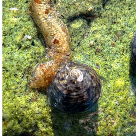
Calliostoma zizyphinum - Painted Top Shell