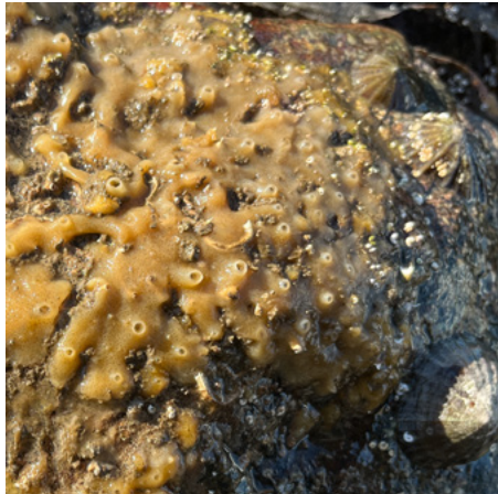
Halichondria panicea - Breadcrumb Sponge