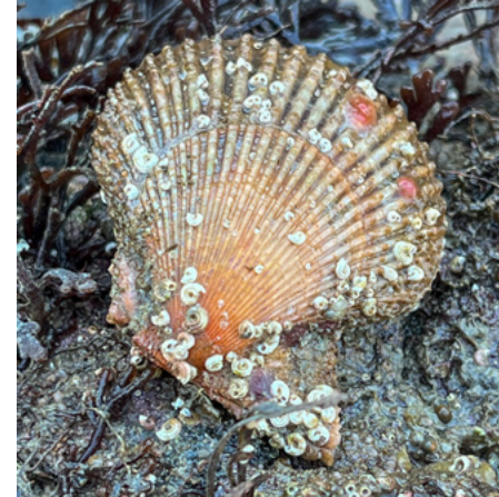
Chlamys varia - Variegated scallop