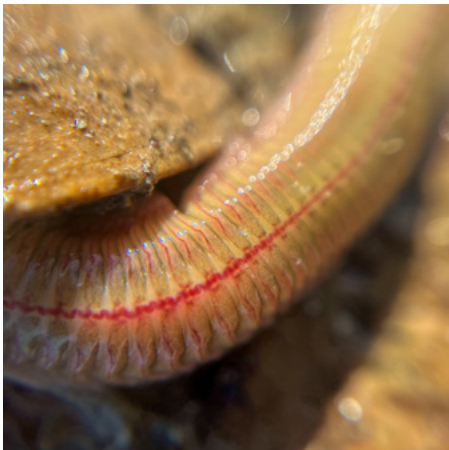
Hediste diversicolor - Ragworm