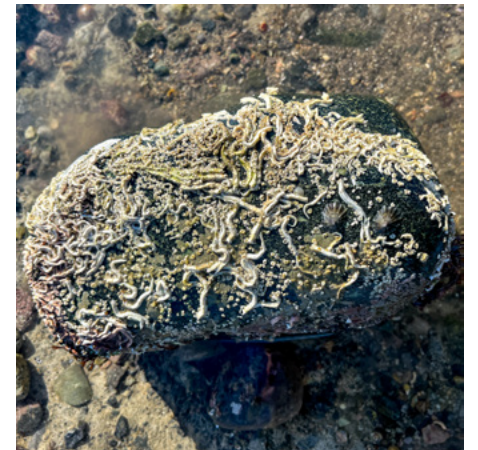
Pomatoceros triquetter - Keelworm