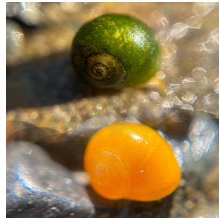
Littorina obtusata - Flat Periwinkle