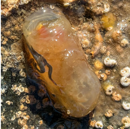
Ascidia conchilega - Sea Squirt