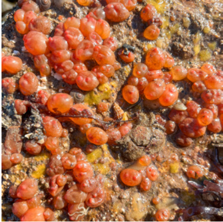
Dendrodoa grossularia - Baked Bean Ascidian