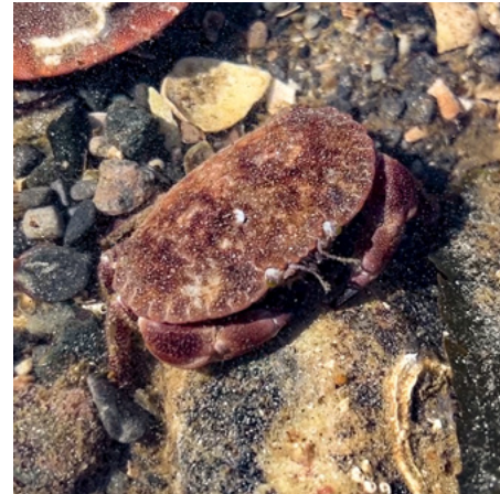
Cancer pagurus - Brown Crab