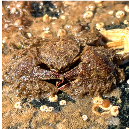
Porcellana platycheles - Porcelain Crab (Broad)